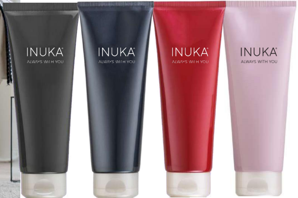
CLASSIC RANGE LOTION - 200ML

For the ultimate long-lasting fragrance experience start your daily routine with the INUKA Body Wash and afterwards moisturize your skin with a matching fragranced INUKA Lotion before applying your favourite INUKA Perfume. This will create a clean and moisturised skin to enhance your all-day long-lasting perfume experience.