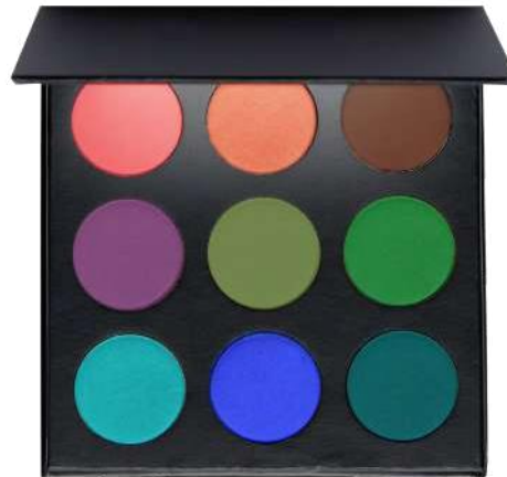
ES72 MATTE COLOUR PALETTE