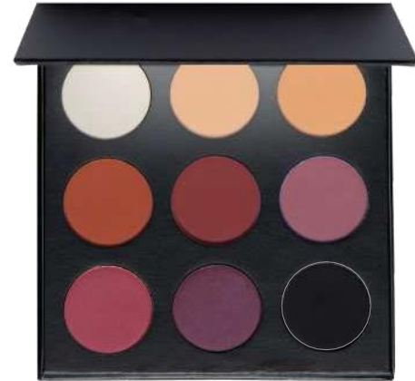
ES70 CONTOURING PALETTE