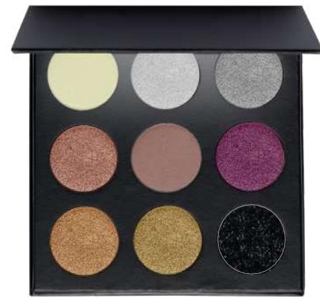
ES71 SHIMMER PALETTE